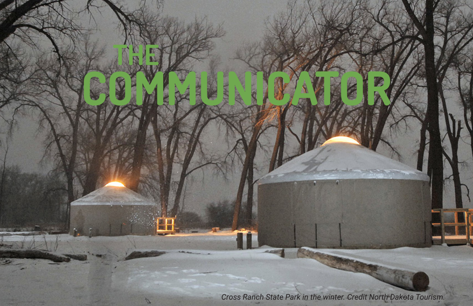
Cross Ranch State Park in the winter.